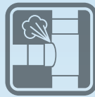
Contaminated Duct System