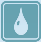
Moisture Issues, Mold, & Mildew