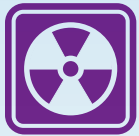
High Radon Levels