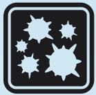
Allergens, Dust, & Odors