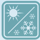
Hot & Cold Rooms