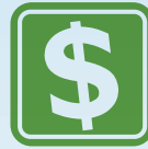
High Energy Bills