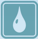
Moisture Issues, Mold, & Mildew