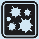
Allergens, Dust, & Odors