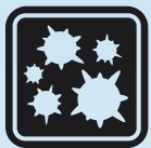
Allergens, Dust, & Odors