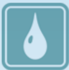
Moisture Issues, Mold, & Mildew