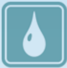
Moisture Issues, Mold, & Mildew