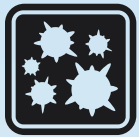
Allergens, Dust, & Odors