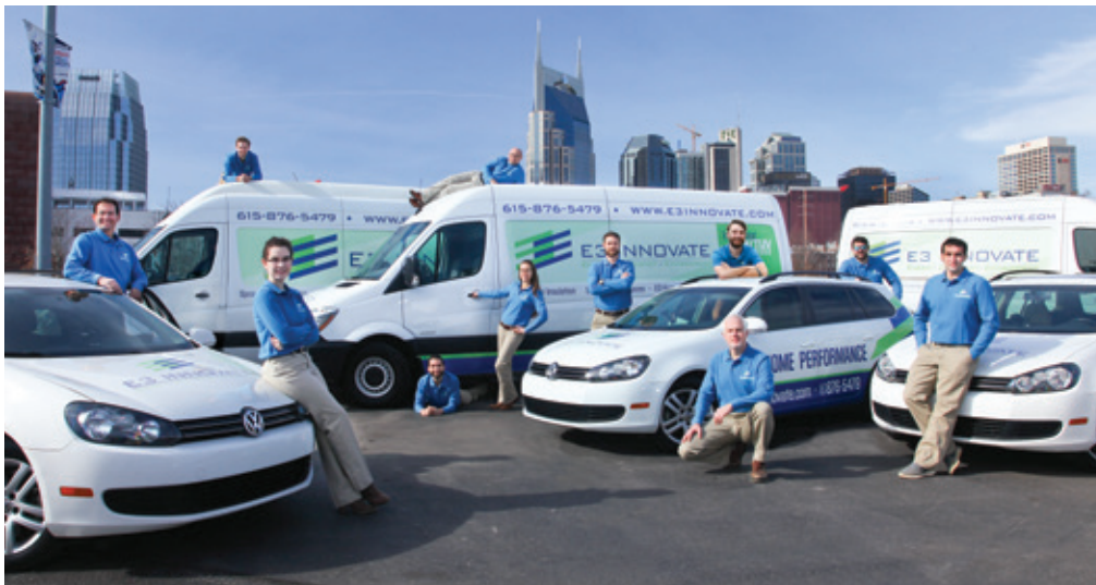
E3 Innovate Team